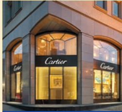
Cartier 现有服务: Set for You by Cartier