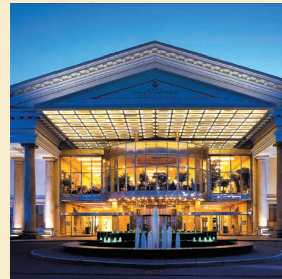
Fall-Winter 2018/2019 • 秋冬2018/2019