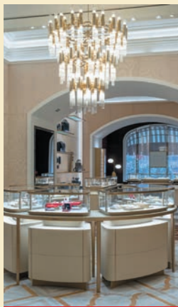
Cartier 现有服务: Set for You by Cartier

古姆共有超过155多家商店和公司的代表处。每天二十万多人来古姆购物。古姆的仓库能容五百车货物。进货卡车进入建筑的地下室, 在指定的扇形面卸下货物。