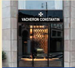
Vacheron Constantin 第一家Vacheron Constantin莫斯科的精品店位于莫斯科的历史中心, 彼得罗夫卡街5号的柏林之家中。