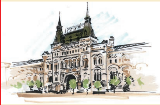
THE MAIN DEPARTMENT STORE

GUM is in the very centre of Moscow, occupying almost the entire side of Red Square opposite the Kremlin. It is designated as a federal architectural monument as it is deemed to be one of the symbols of Moscow.