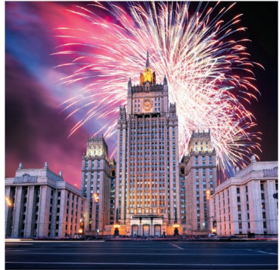
Fall-Winter 2017/2018 • 秋冬2017/2018