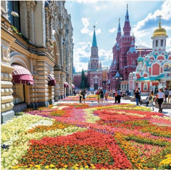
Spring-Summer 2017 • 春夏2017