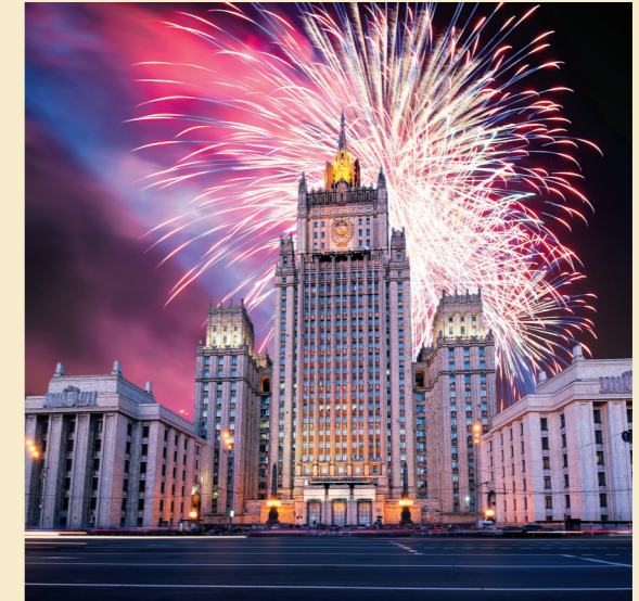
Fall-Winter 2017/2018 • 秋冬2017/2018