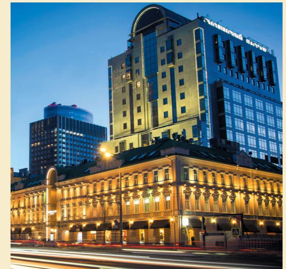
Spring-Summer 2019 • 春夏2019