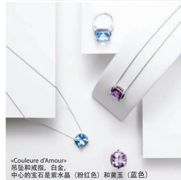
«Couleure d'Amour» 吊坠和戒指，白金， 中心的宝石是紫水晶（粉红色）和黄玉（蓝色）