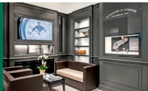
A.LANGE & SÖHNE, Stoleshnikov Pereulok, 5. Metro «Teatralnaya», Moscow, + 7 (495) 775-1815

精品店的物品种类繁多, 并且都是手工制作。包括著名的手工手表, 还有其他的艺术品。莫斯科的精品店A. Lange & Söhne是一个对钟表艺术鉴别家来说宝贵的礼物。这家精品店完全符合制作工场要求的实用性和创新最高的标准。大厅的设计能让顾客了解品牌的历史, 获得它最重要的价值。用传统花做的品牌, 小的图书馆和钟表工的工作场所强调了精品店特殊的气氛。现在有了新店, 在萨克森工场以外。