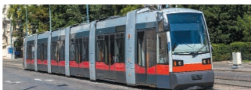
TRANSPORT IN MOSCOW