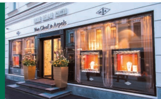
VAN CLEEF & ARPELS, Stoleshnikov Pereulok, 9. Metro «Teatralnaya», Moscow, +7 (495) 937-9042

2012年6月, 顶级珠宝品牌Van Cleef & Arpels (梵克雅宝) 在莫斯科的新专卖店正式开业, 新店位于斯特尼克夫小巷9号。从外观上看, 新店整体精美豪华, 而内部装修则以高级灰绿色为主色, 雅致大方。专卖店共两层, 售有梵克雅宝Alhambra 和Perl é e经典系列, 以及Poetry of Time系列高级手表。新店高雅且迷人, 融合了古典与现代风格, 在这里, 您能感受到梵克雅宝品牌特有的魅力及其追求完美的精神。