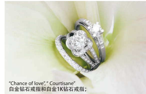
“Chance of love”, “Courtisane” 白金钻石戒指和白金1K钻石戒指；