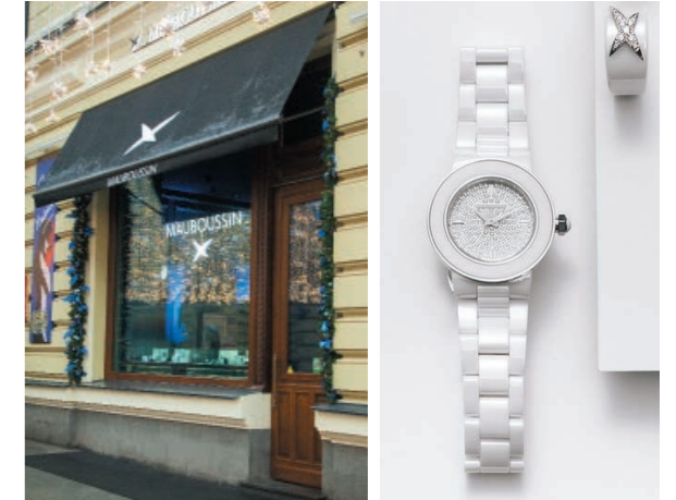
“Amour Le Jour”系列腕表，“Seiko”（“精工”） 石英，陶瓷，156颗钻石，«L'Etoile de l'Ange» 系列戒指，白金，钻石密镶式镶；