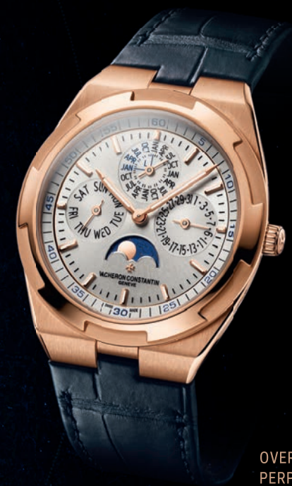
OVERSEAS ULTRA-THIN PERPETUAL CALENDAR